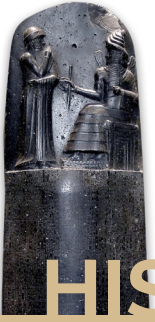
1750 BC Hammurabi introduces his Code of Laws