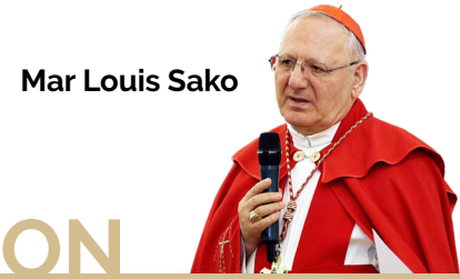
Mar Louis Sako